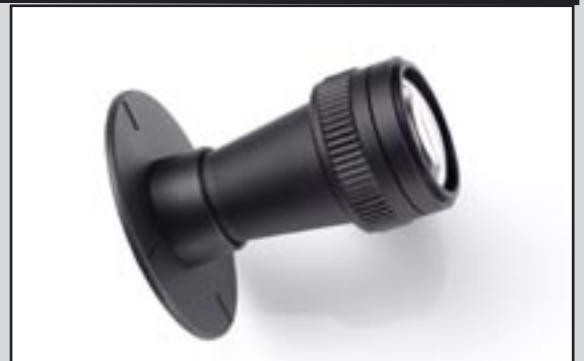
Measuring probe for contact measurements