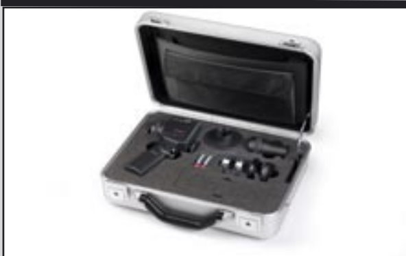
The MAVO-SPOT 2 USB is supplied in a practical, strong aluminum transport case