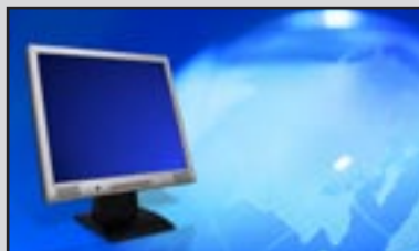
Measuring the reflections at monitors