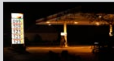
Measuring light immissions