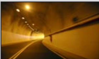
Lighting of tunnels