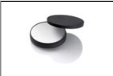
GOSSEN Reflexion Standard