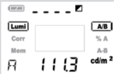
Read-out in the display of luminance measurement

A data memory for storing up to 1000 single measuring values, which can be subdivided into 10 groups, is available in the MAVO-SPOT 2 USB. The memory data can be visualized and processed directly with the keyboard and the display or also in the PC via USB Port and the included standard software.