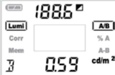
Luminance ratio measurement A/B