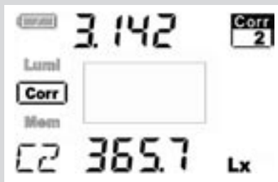
Lux measurement with Reflexion Standard