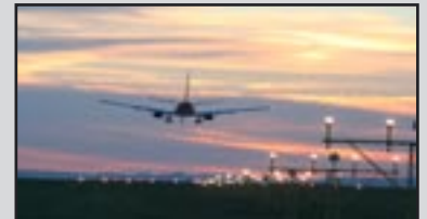
Measuring airfield guidance lights