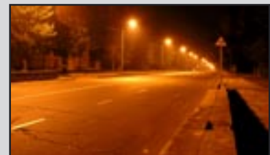
Lighting of streets