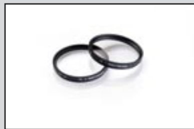
Close-up lenses 1 and 2